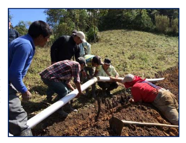
Common to all WEFTA projects in Honduras and elsewhere is the teamwork among community members and commitment to the common good

Funding was provided by the American Chemistry Council, USAID, WEFTA, and the local community.