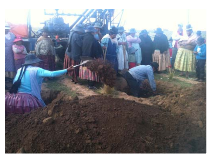
Women and men alike from the community assist with the excavation of the pits to be used to prepare the drilling mud. Hard physical labor is nothing foreign to the Aymaran people.

They mentioned to the Suma Jayma team that they knew of other drilling efforts in neighboring communities taking more like a month to complete by other drillers.