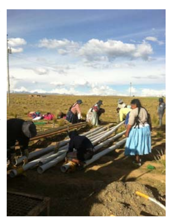
Gathering and preparing the well casing pipe

This project will benefit 31 families, or a total population of approximately 155 people. Construction should be concluded in early 2016.