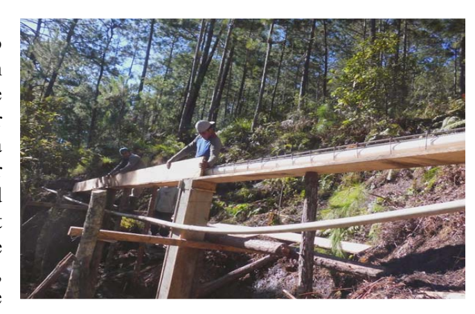
Topography and soil conditions can be challenging in some cases, resulting in the need for creative solutions.

The town of Monquecagua is home to approximately 2,400 people, of whom approximately 600 do not have water, and the rest had only intermittent water service of poor quality. In 2014, the community embarked on a multi-phase project to obtain a new water source, construct a new storage tank and chlorination unit at higher elevation (where it can serve the entire community), and upgrade the existing distribution system with larger. better quality PVC pipes to provide more reliable water service and hook-up currently unserved areas.