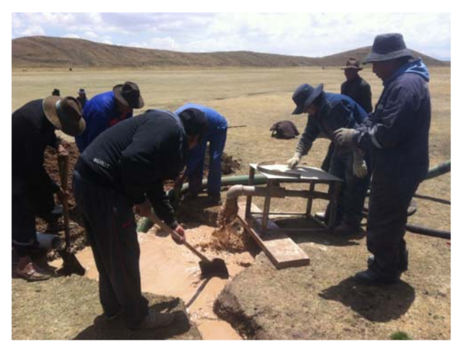
The important task of mixing the drilling mud. One of the ways the locals can help.