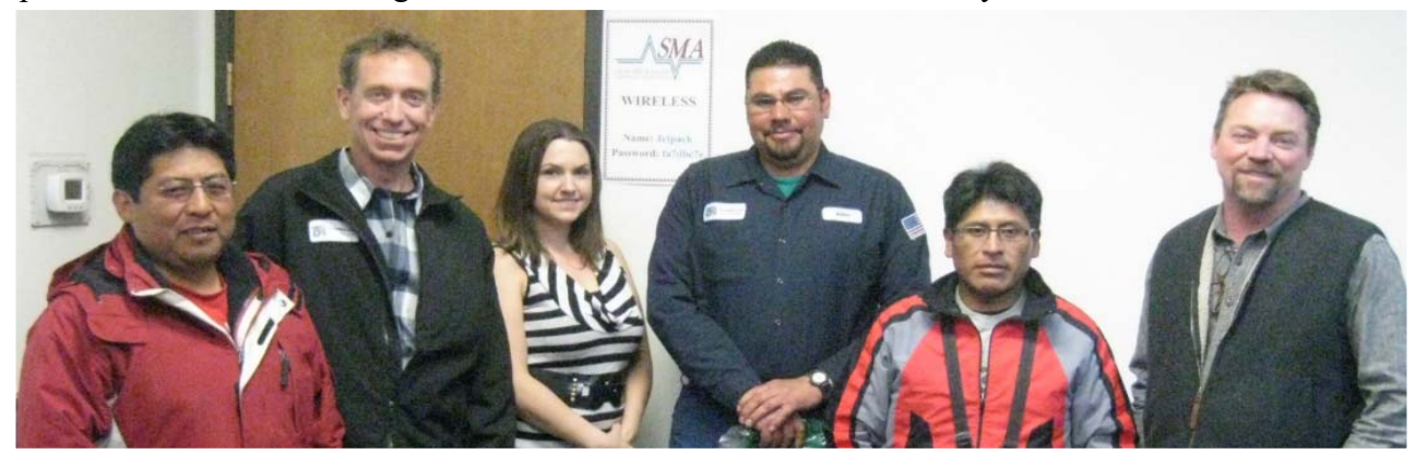
Bolivians with representatives from Rodgers & Company, Hydrogeologic Services, Inc., and Souder, Miller & Associates after presentation in Albuquerque.

While in New Mexico, the team gave two very compelling presentations of the type of work they've been involved in over the years, in collaboration with WEFTA and Souder, Miller & Associates (SMA); one in Santa Fe and another in Albuquerque. Both presentations were wellattended by SMA staff and several special guests, including the well drillers mentioned above, other locals involved in the water and sanitation sector in New Mexico, politicians, and the general public interested in learning about the work of WEFTA and Suma Jayma.