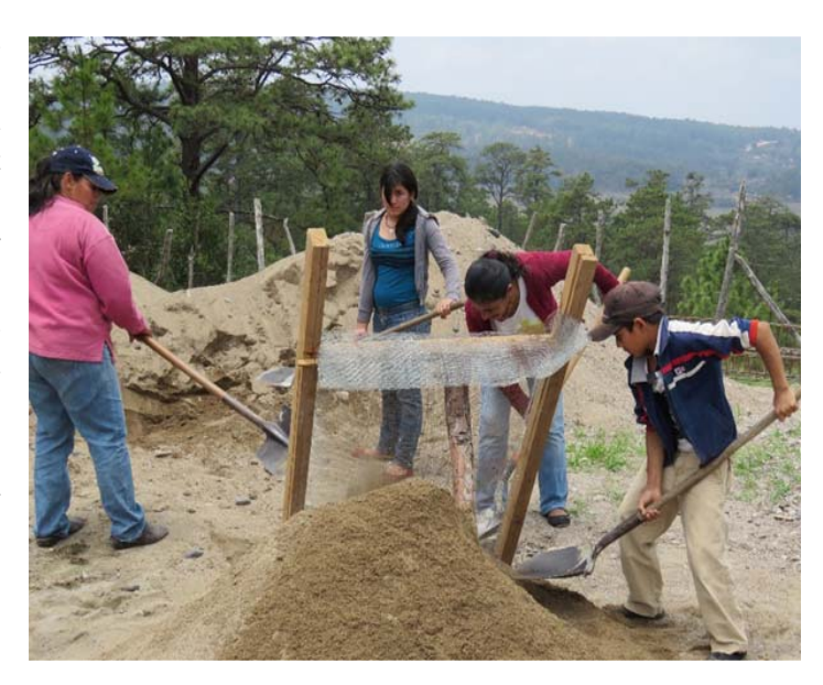
The whole family pitches in preparing sand for the concrete mix.

The town of Yamaranguila built its first water project in 1987, serving 100 families. When WEFTA first started working with the community in 1999, it had a population of less than 1,800 people and provided water approximately 6 hours per day before the tank dried up and the community ran out of water. The WEFTA project completed in 2004, made possible by contributions from the American Chemistry Council (ACC) and the Vinyl Institute, alleviated shortages and allowed community to grow. By 2015, population had more than doubled to 4,000 people, and again began to experience water shortages as the town outgrew its water supply. Moreover, the