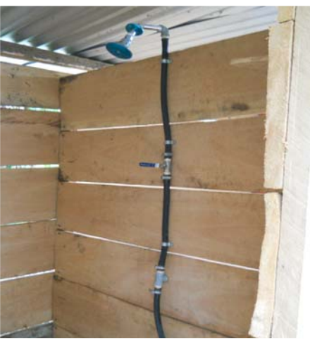
Interior of a completed shower.